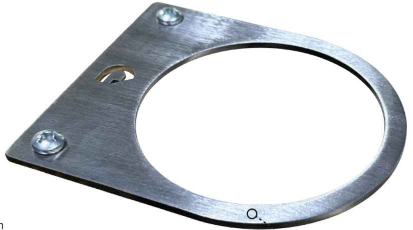
TABLE SIDE MOUNT KIT